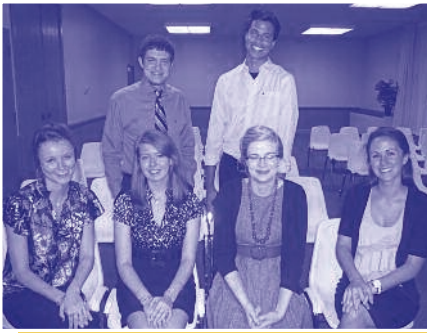
2010-2011 Executive Board.

chapter, which was as exciting for him as it was for us.