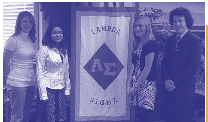
Beta Mu Officers.