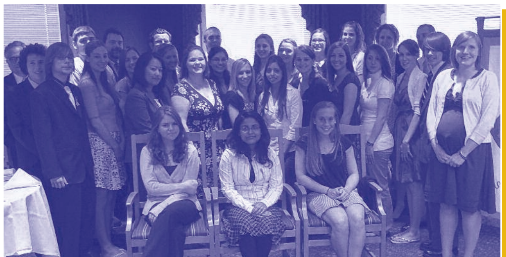
Charter member, advisors and guests.