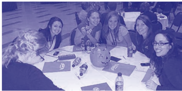
Making Halloween cards for the Children's Home.